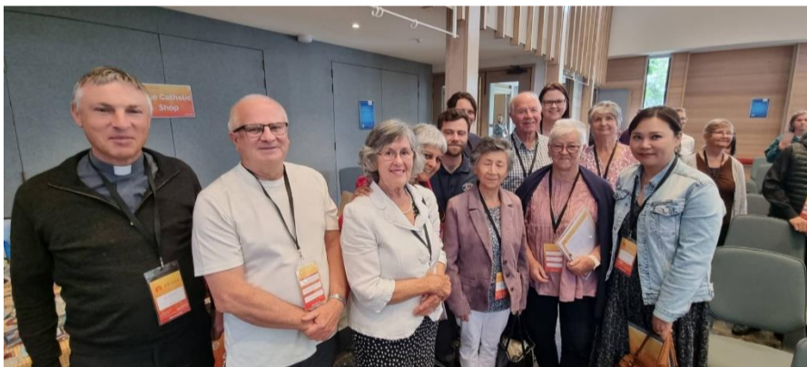
Some of the Selwyn Parishioners at the 'Ablaze Conference'