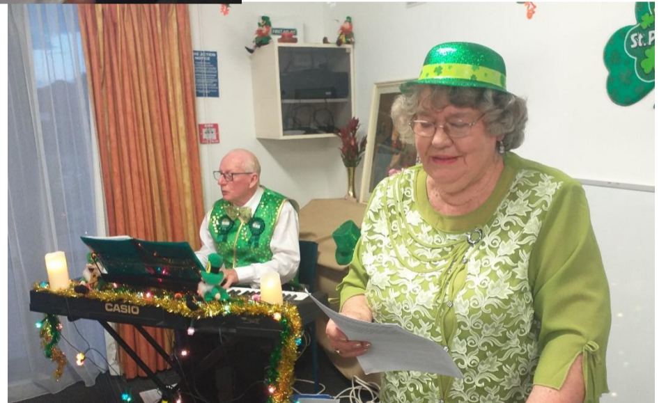
A very green celebration of St Patricks Day in Leeston