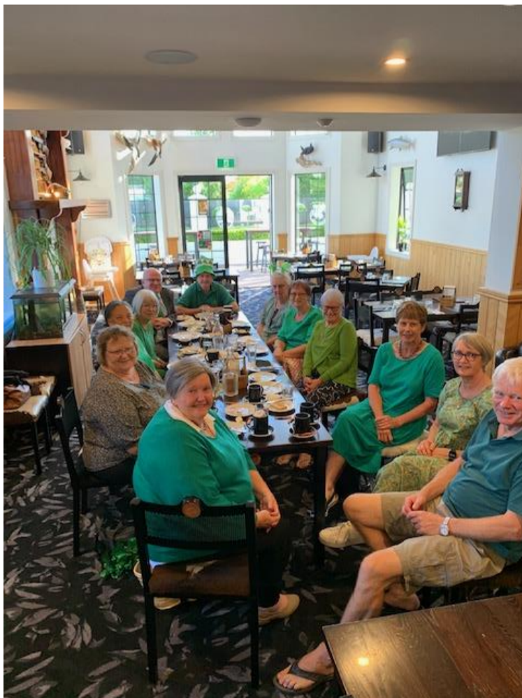
Leeston Ladies Day out. Coffee in Darfield, on our way to Oxford.