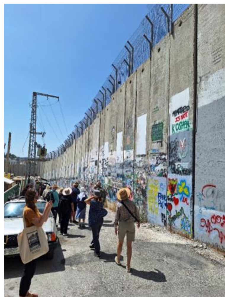
Graffiti on the Bethlehem Wall . (Bethlehem side of the the Wall)