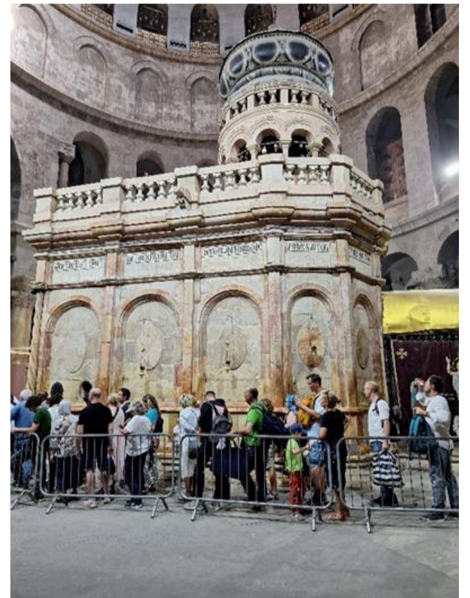
Church of the Holy Sepulchre – Jerusalem

Last Saturday I arrived in Israel to begin a 4 week program at Tantur Ecumenical Institute . I am part of an international group of 12, with people from the USA, Canada, Korea, UK, Australia & NZ. We come from a range of different Christian denominations with most of us being Pastors. On my 1st day here I walked to Bethlehem which is just 10 minutes away. Bethlehem is in the Palestinian area & you have to go through a check point. It is a bit intimidating as there is a huge concrete wall which marks the border. I can't help but feel sad for the Palestinians who live behind the wall. The following day I caught a bus to the Old Jerusalem City & attended a Bazantine Mass which was in Arabic. It was very different to Mass in NZ with a lot of incense & chanting. Afterwards I went to the Church of the Holy Sepulchre. This is considered to be the holiest site in the world for Christians as it contains the site where Jesus was crucified & Jesus' empty tomb. It was moving to be there & I look forward to visiting again during my stay to celebrate Mass & spend time in prayer & reflection. I have wished to visit the Holy Land for many years & it is wonderful to be in Jesus' homeland. Thanks to those who have been in contact: I enjoy hearing how people are. Take good care & know that you are all in my prayers.