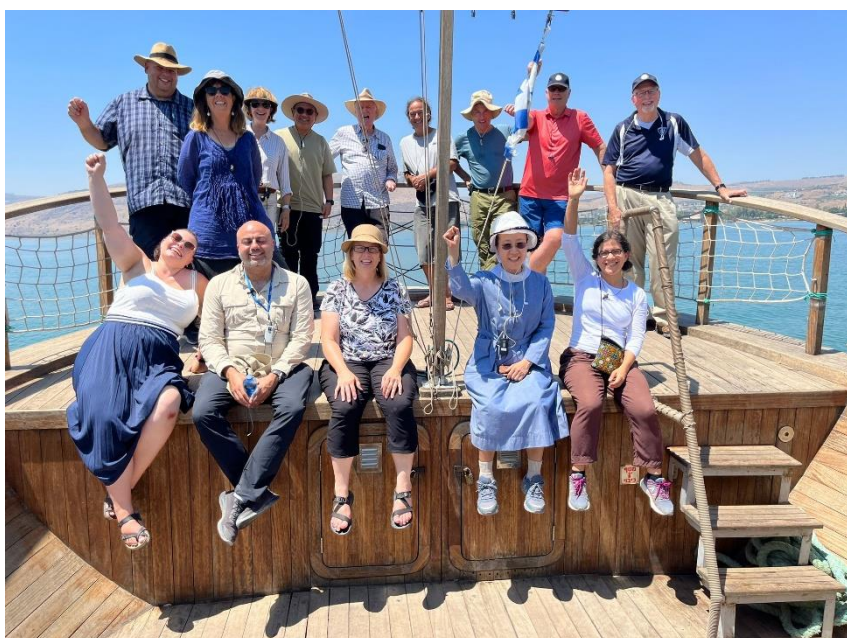
Sailing on Lake Galilee