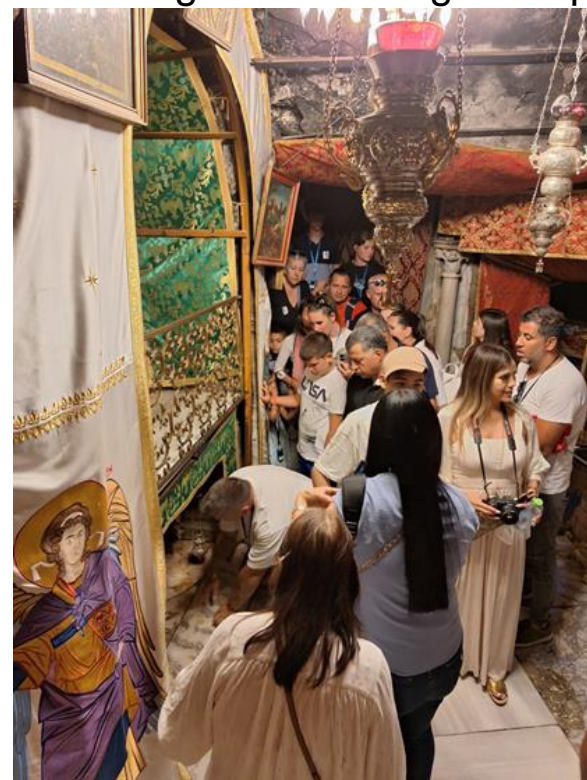
Church of the Nativity the grotto of Jesus birth, Bethlehem.

21 st July Hi Everyone Greetings from Galilee