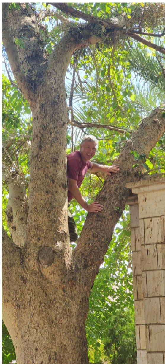
Up the Zaccheus Tree.

Tomorrow, I depart for Tel Aviv & fly to Australia a day later. While there I will be travelling for a few weeks before returning home. This is my last update & it has been a pleasure sharing some of my experiences with you. I look forward to seeing you back in New Zealand. I wish you all well & keep you in my prayers.