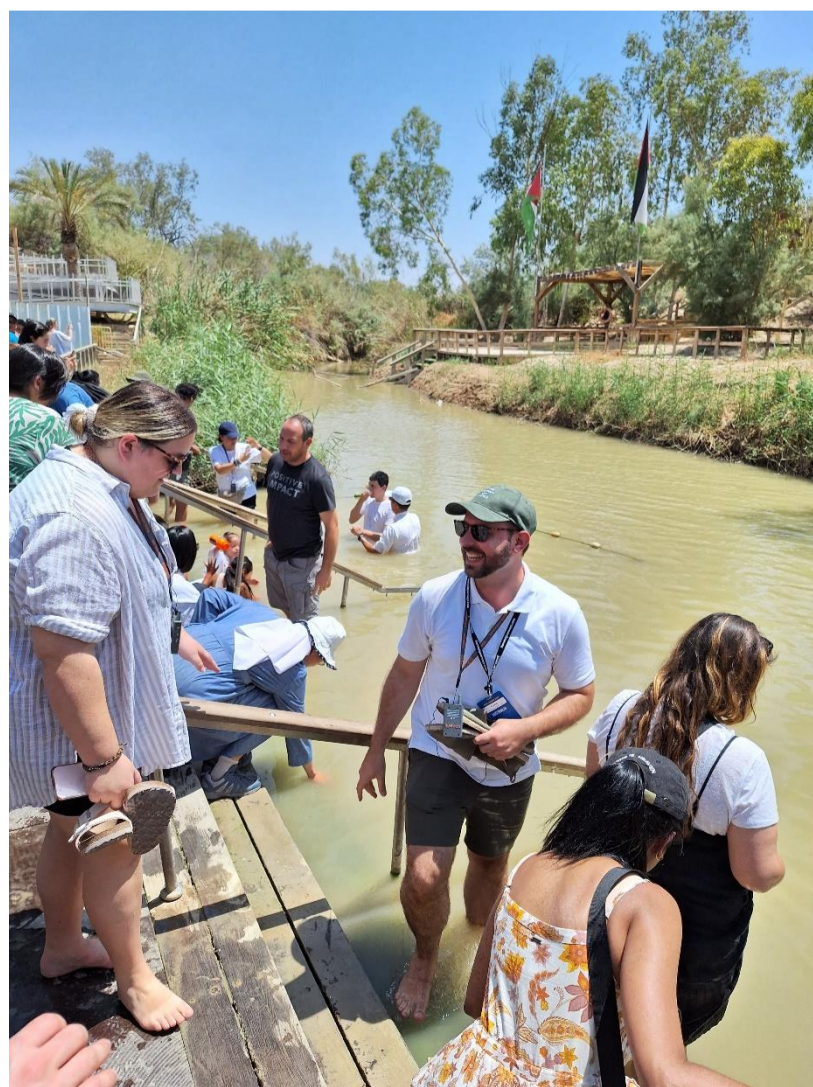
The Jordan River (Near the Dead Sea) where St John the Baptist baptised Jesus