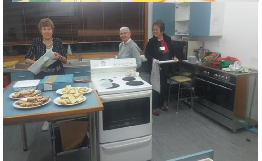
Alpha Group ...evening meal